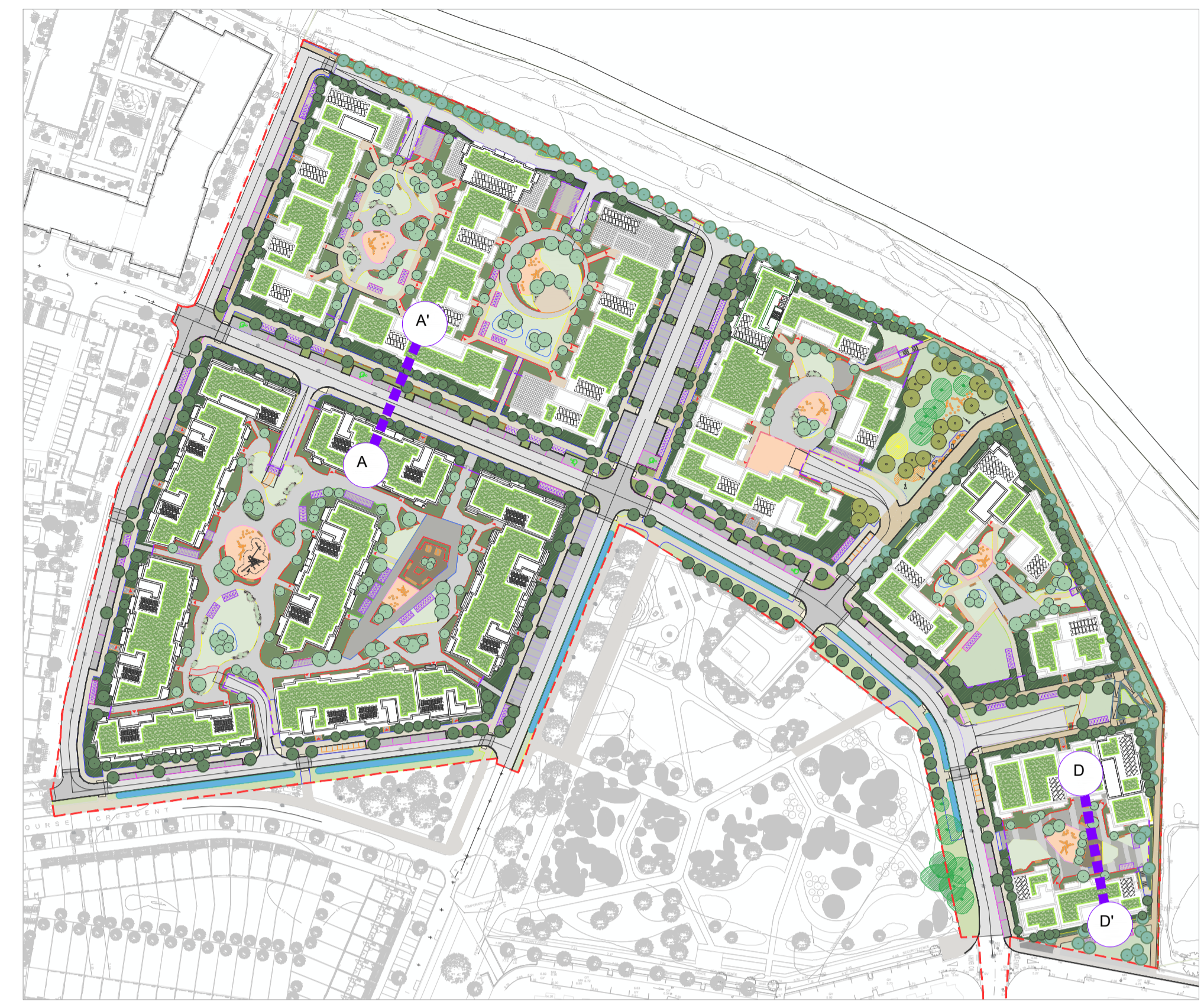
Key Plan Scale 1:1500